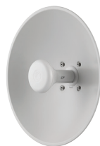
ePMP Force 200