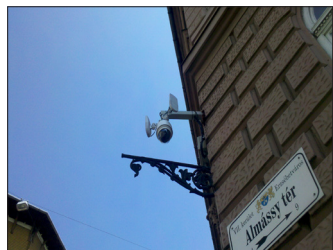
ePMP Modules Connect Cameras and Provide Bandwidth for the Next Camera in the Architecture

While the analog network had performed well, new technology was available to enhance performance. Image quality would be improved by installing High Definition (HD) IP based cameras across the network. New network encoders would be used to process the images, and an all-wireless network owned and operated by the city would replace costly leased lines that were connecting each of the 90 cameras.