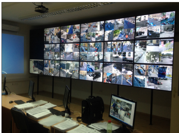
Video Surveillance Operations Center

This would provide a higher definition security system while saving the city the monthly costs of leased line infrastructure. VideoData was awarded the contract, with the requirement that the solution would have to be designed, installed and handed over to the city in 90 days.