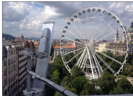
ePMP Access Point in Budapest City Center