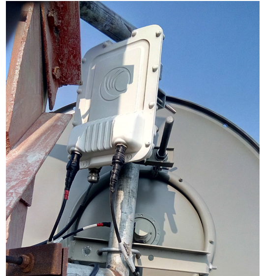
PTP 650 with Antenna

The PTP 650 link was tested by engineers from both AIM Enterprises and BSNL as a pilot project. Once established, the link was turned over to BSNL and the local government. In addition to higher performance, the PTP 650 delivered connectivity at a substantially lower cost than alternative technology. The system has saved approximately $37,500 USD per year.