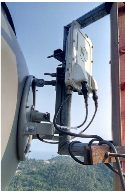
Neil Island link