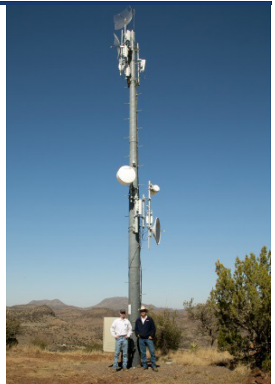
Tower with backhaul and Access Points