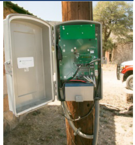
Thinroute Residential Gateway for VoIP Services