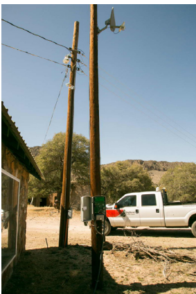
Subscriber Module at Customer Location