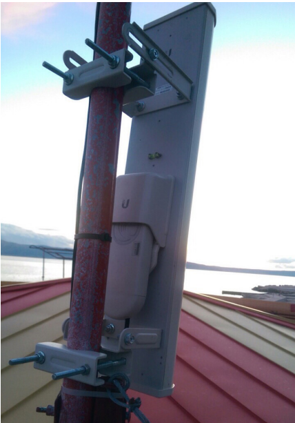
ePMP Access Point

“The twelve Hotspots were deployed around the city center two months ago, and they have worked perfectly,” says Ivanović. “We deployed the Hotspots with the standard antennas and we see ranges of 100 meters. Now people can connect in the city center and in restaurants. The system has revitalized the town center.”