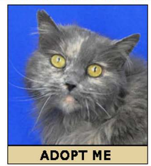
<u>Sadie</u>: I'm Sadie, a long haired senior lady looking for a nice warm lap to snuggle in and get may beautiful hair brushed. Got some time and love to devote to someone who will be devoted to you? I'm offered at a senior price of $10. (Pet ID# 7565)