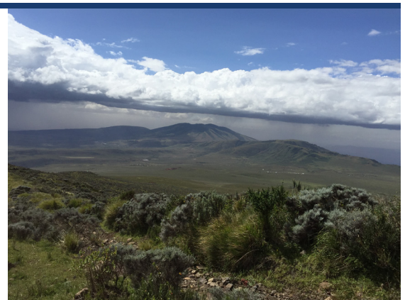
The Ngorongoro Conservation Area