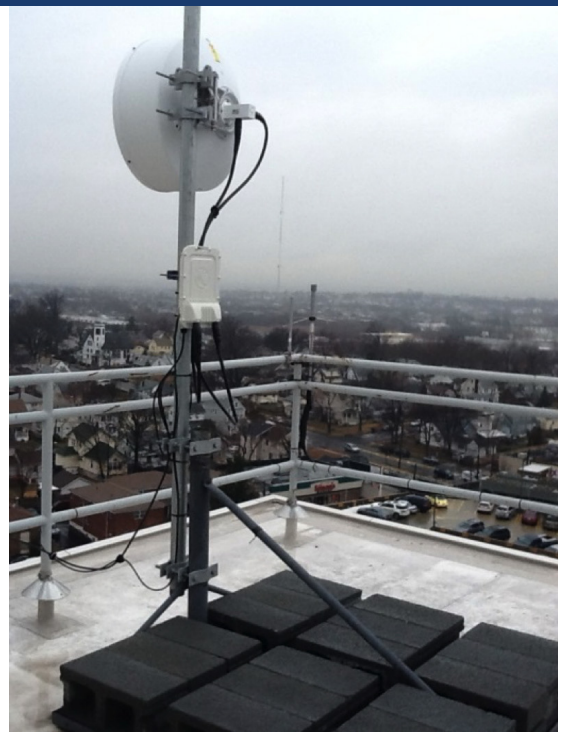
Image of PTP 650 Link, ballast weight temporary mount, roof of HackensackUMC

THE SYSTEM PERFORMED FLAWLESSLY THROUGH THE ENTIRE WEEK , and for the doctors and staff, it was as if they were in the main hospital facility.