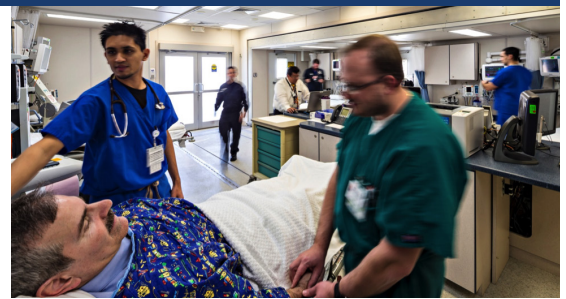
Video Simulated patient, interior of Mobile Satellite Emergency Department (MSED)

HACKENSACKUMC CONTACTED PIERCON SOLUTIONS LLC ( www.piercon.net ) to assist in designing and implementing a connectivity solution for the Super Bowl deployment to enable the NJ-MSED to link with the HackensackUMC main campus computer network. PierCon Solutions is an experienced communications networks provider. In 2012 during the aftermath of Superstorm Sandy, HackensackUMC worked with PierCon to provide connectivity between the NJ-MSED's and the data center of a hospital that had been taken out of service by the storm. The NJ-MSED replaced hospital emergency departments. The best solution was to deploy secure Point to Point (PTP) microwave radio backhaul links from Cambium Networks (PTP-600 series) that operated independent of