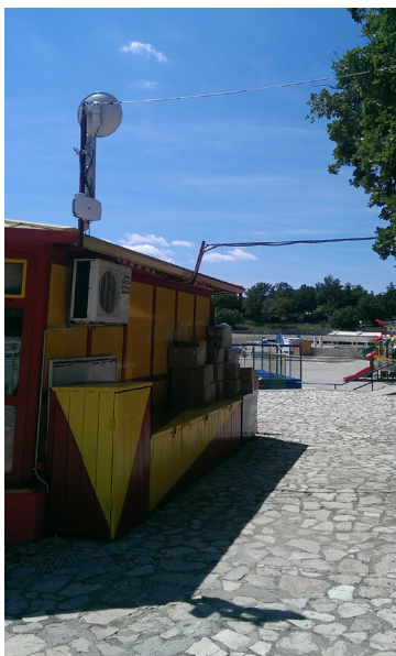
ePMP module with passive reflector connects a residence