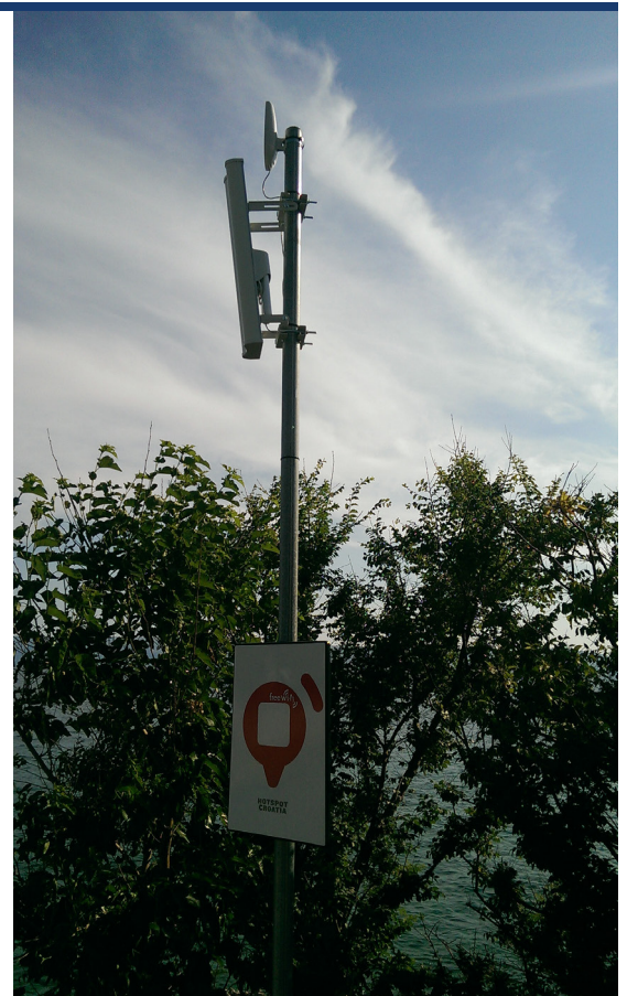
ePMP backhaul and Access Point