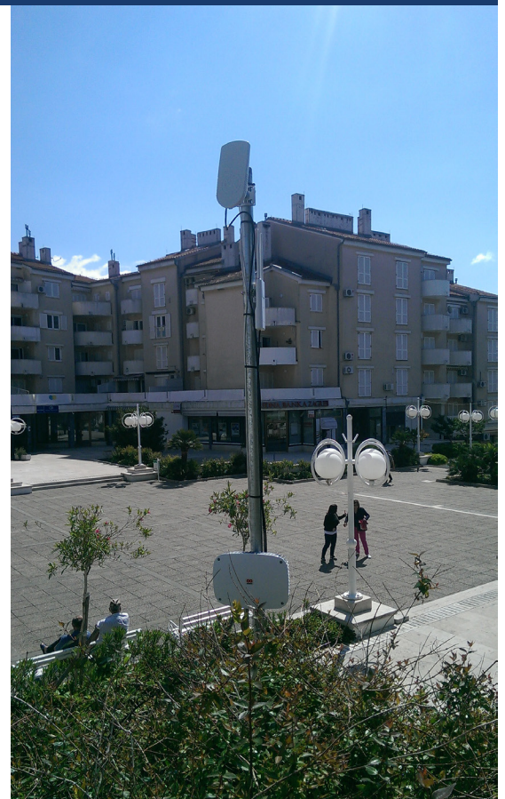
ePMP Subscriber Module connects a Public WiFi Access Point