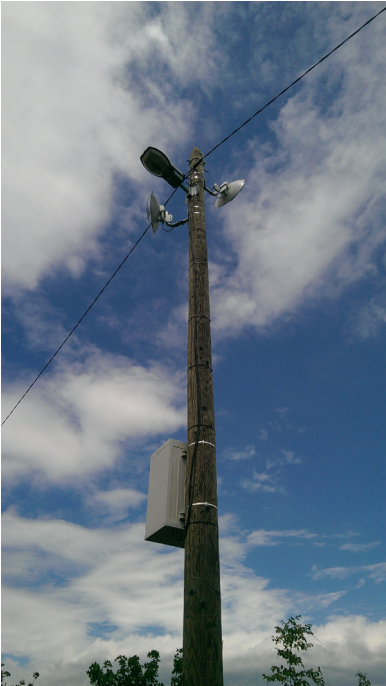
ePMP Force 110 point to point backhaul links

“We had an IT customer who was so pleased with their service they recommended us to the local Port Authority. They were looking for a solution to provide broadband connectivity to the luxury yachts that are in port and at anchor. We provide connectivity for them and they too are satisfied with the connectivity we offer.”