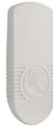
ePMP Integrated Module