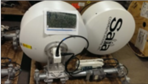
Equipment staged at Saia Communications facility

Once all of the links are established they will be integrated into the County’s Wireless Manager system to monitor performance in real time and assist in maintenance and troubleshooting.