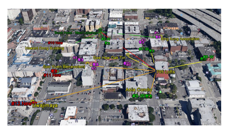
Google earth view of the network

a reliable and cost-effective video surveillance service in the busy Chinatown International District. The first installation was so successful, flexible and easy to maintain that Cascade Networks decided to rollout similar systems across other districts. This includes businesses and university complexes in the area. Finally, the community got the safety reassurance it needed and the ability to look forward towards new levels of economic growth.