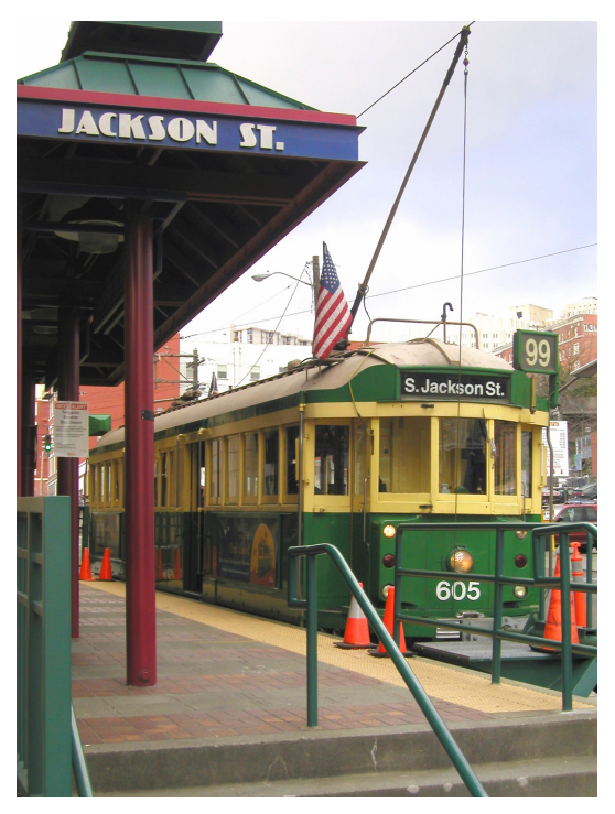
Jackson Street Trolley

The existing wireless mesh surveillance system connected ten cameras over a six square block area to maintain safety. This system was inefficient and unreliable causing information loss, and was difficult to support. Cascade Networks decided to find a better solution that would be easier to maintain and expand going forward, serving this booming multicultural community.