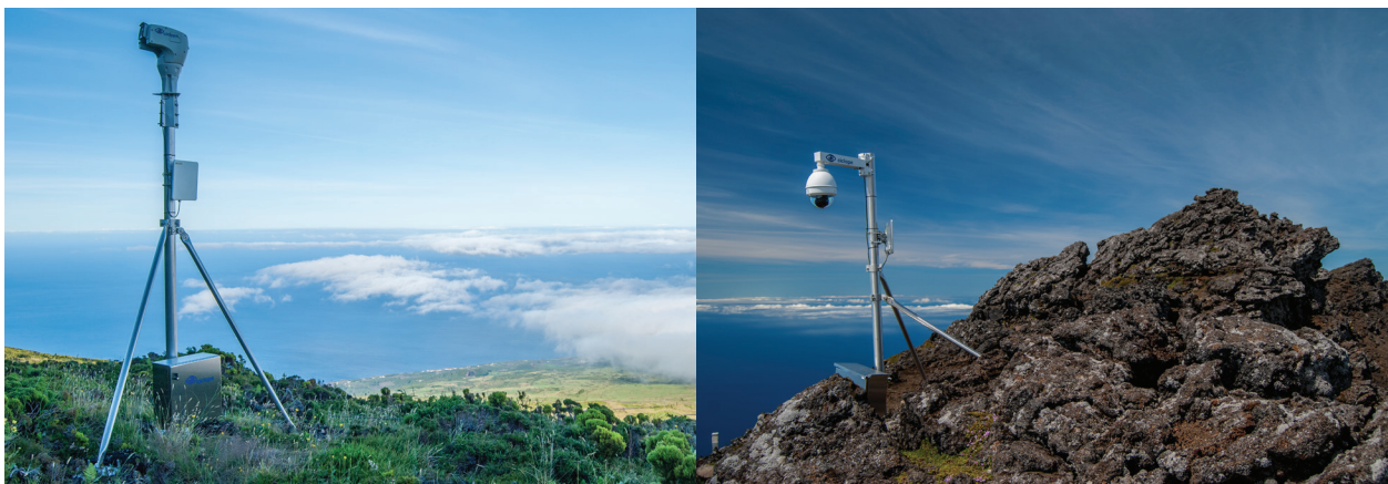
FIGURE 1: REMOTE LOCATION VIDEO SURVEILLANCE BACKHAULED USING PTP LINKS FROM CAMBIUM NETWORKS PROVIDING VIDEO COVERAGE OF WALKERS ON MT PICO, PICO ISLAND, AZORES

Whether the surveillance camera is installed on the side of the building, on a lamp post or at a remote location, it must be supplied with power. For every camera installation, a power connection is a given but a network connection is not. Cameras mounted on the side of a building might be wired to an existing LAN or have access to Wi-Fi but in many locations, network connectivity will not be available. Even in locations where wired networks are available, it might not be appropriate to dig trenches or run cables. It is in these remote, unconnected and difficult to connect locations where a wireless camera backhaul comes into its own.