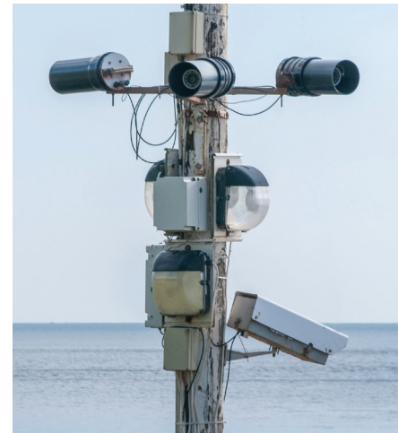
FIGURE 3 : WITHOUT PROPER PLANNING, CAMERA INSTALLATIONS CAN SOON BECOME MESSY AND DIFFICULT TO BACKHAUL