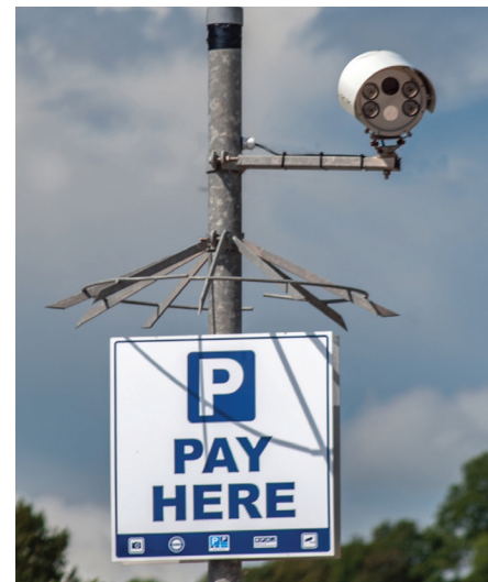
FIGURE 2: VIDEO ANALYTICS INCLUDES THE USE OF ALPR CAMERAS

In any surveillance situation, the reliability of the equipment is extremely important. This applies to the camera, to the backhaul and all the network devices. The equipment operating temperature must be considered as both the cameras and wireless backhaul could be mounted at locations that experience a wide daily temperature variation or temperature extremes.