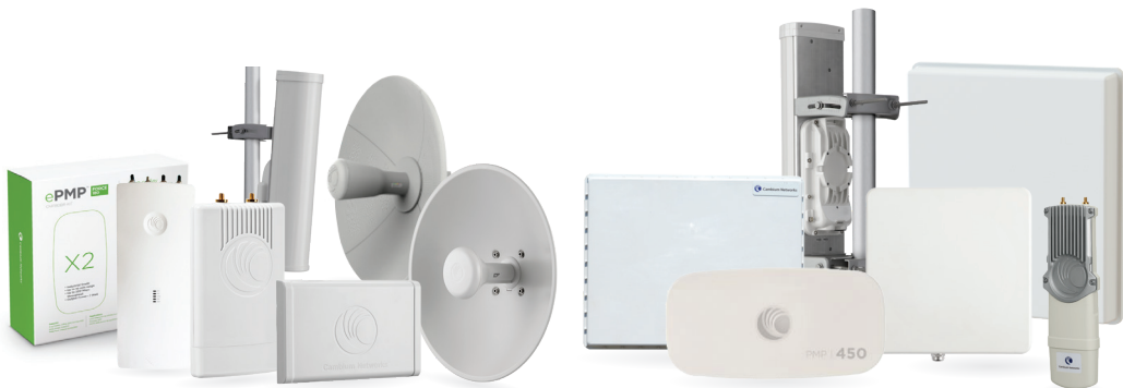
(L to R) ePMP™ Bridge-in-a-Box, ePMP 3000, ePMP 2000 AP, Smart and sector antenna, Force 190, Force 200

Our wireless access solutions enable your organization to deploy and extend high-speed communications more quickly and much more cost-effectively than fiber or wired solutions. Cambium technology significantly reduces the cost of deployment and time to market, allowing for installation in a matter of days or weeks, versus months or years. The platform's exceptionally low acquisition, installation, operation, and maintenance costs result in substantially lower total cost of ownership, as well as delivery of ROI in months.