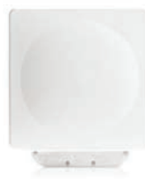
PTP 670 High Capacity Multipoint (HCMP)