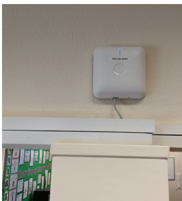
cnPilot™ e410 Indoor