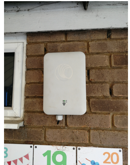
cnPilot™ e500 Outdoor

To further streamline the project, 5u installed Cambium Networks cloud-based end-to-end wireless management system cnMaestro™ to provide general support service provisioning and efficiently transfer management of the system. With cnMaestro's autonomous AP management, operations can be facilitated at the service layer – without compromising internet services – and provided the school with a solution that simply worked. Bench testing of the solution was carried out at 5u's pre-staging labs to ensure the solution could support the needs of the school before it was installed, making the transition as seamless as possible.