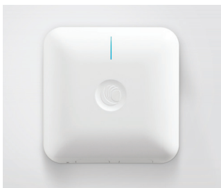
cnPilot e410 • 802.11ac Wave 2 2.4 & 5 GHz • 2x2 MIMO

– Aurélie Challes, Head of Technical Services for the Coutances mer et bocage community