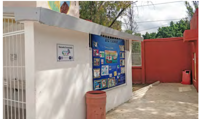
Connected schools are more prevalent in Guanajuato thanks to the Digital Divide Reduction Program.

By shifting their network to Cambium Networks technology, CEMER SC achieved higher bandwidths, less latency and increased availability. This translated to a smoother user experience, faster network speeds and increased simultaneous user capacity. Specific benefits included: