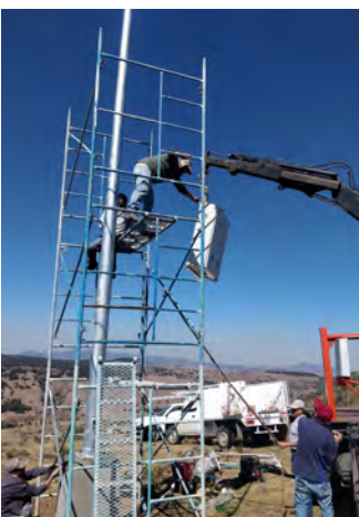
Implementation is carried out by authorized installers and lasts, on average, one day per site.

This point-to-multipoint (PMP) solution connects businesses and communities by transmitting data between a radio base and multiple locations. CEMER SC deployed six radio bases in strategic points throughout Guanajuato with an average implementation time of one day per site. The addition of cnPilot™ e500 Outdoor Wi-Fi Access Points provides strong, high performance Wi-Fi service to public outdoor spaces in the region. Through public and school connectivity nodes, the radio bases supply free internet service for schools and communities.