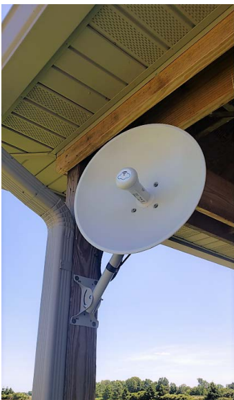
Installation was possible under the eave on the northeast corner, avoiding an invasive installation on the roof of the customer's house and allowing for a short installation time.

Ionia Unlimited chose Cambium Networks' cnHeat™ to plan their ePMP 2000 network. cnHeat is a web-based radio frequency (RF) planning system that makes it easy to see a customer's location immediately and accurately predict where service can be obtained – so easy that it can even be accessed on a smartphone. cnHeat allows Ionia Unlimited to understand where a mounting mast can be used in order to get service.