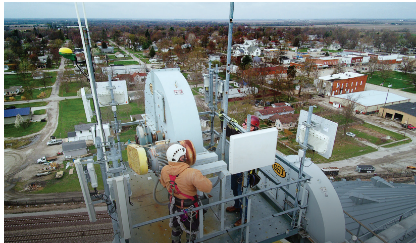
Fixed Wireless Broadband Distribution

Being wireless-aware does not stop with just cnPilot APs. Cambium Networks' outdoor fixed broadband wireless wide area network portfolio also takes advantage of the wireless-aware cnMatrix. Network operators can connect two Cambium radios configured to operate on the same spectrum. The wireless-aware cnMatrix, leveraging proprietary signaling, will appropriately configure the solution to operate in an active-standby mode thereby providing much needed redundancy and maximizing the use of very limited spectrum. It should go without saying that this solution will auto-fail-over if needed, providing for uninterrupted uptime for users.