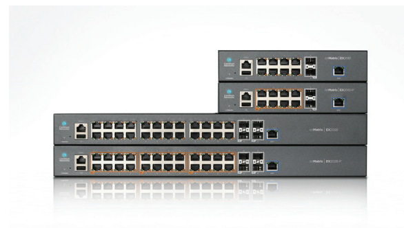
cnMatrix Access Layer Switches

The innovative Policy Based Automation (PBA) functionality on the upstream cnMatrix can also be used to support zero-touch configuration for any wireless device. Automatic detection of Cambium Networks wireless devices is natively supported by PBA. General device characteristics can be specified as well to facilitate automated detection of devices from any vendor. Following device detection, a plethora of actions can be initiated - from auto-segmentation via VLAN creation and port membership assignment to establishing the appropriate default Quality-of-Service (QoS) settings for the discovered device. cnMatrix streamlines and simplifies configuration of a secure and maintainable switching infrastructure.