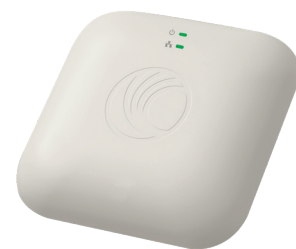
cnPilot Enterprise Access Point

cnMatrix pushes the automation envelope even further with built-in Intelligent Power over Ethernet (PoE). With Intelligent PoE, cnMatrix can auto-detect the PoE requirements of certain connecting devices, in addition to providing complete hands-on control over all PoE functionality. cnMatrix switches support the different requirements of both IEEE-standard active PoE and non-standard passive PoE. cnMatrix will support 802.3af/at/bt PoE as well as 24V and 54V passive PoE. cnMatrix PoE management provides the ability to control per-port PoE status settings and monitor per-port PoE statistics such as voltage, current and instantaneous power being supplied.. This is yet another cnMatrix wireless-aware tool in the arsenal for troubleshooting and diagnostics.