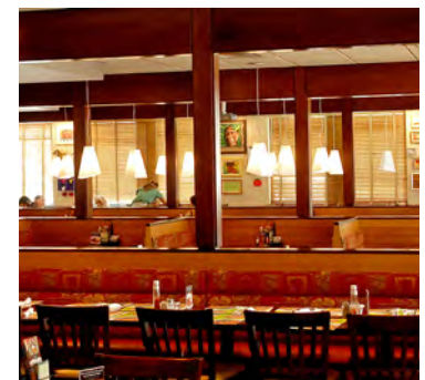
In addition to offering reliable Wi-Fi, Applebee's is able to deliver personalized messages to customers.

Tying everything together, Applebee's simplified their device management with cnMaestro™, Cambium Networks' free wireless network manager. cnMaestro enabled them to install, operate, monitor and manage the entire network with ease and full network visibility.