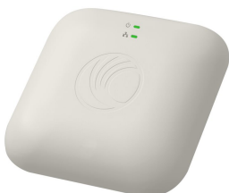
cnPilot™ e400 Indoor Enterprise AP