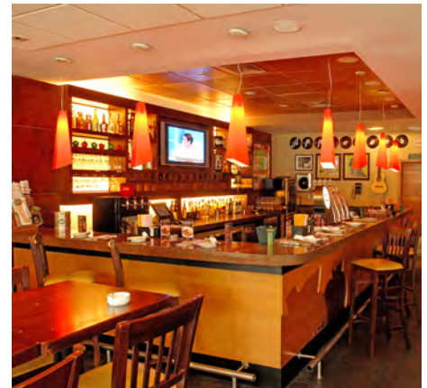
Applebee's Brazil locations needed a solution that was compatible with Wispot.

To meet customers' expectations, the restaurant chain needed streamlined Wi-Fi service, quality WLAN, a better understanding of their customers and Wi-Fi compatible with their Wispot social Wi-Fi solution ( www.wispot.com.br ). Wispot allows their customers to join restaurant Wi-Fi, and it sends messages and advertisements directly to mobile devices. Applebee's needed a solution that would cover an area of 500 square meters per location while meeting all expectations.