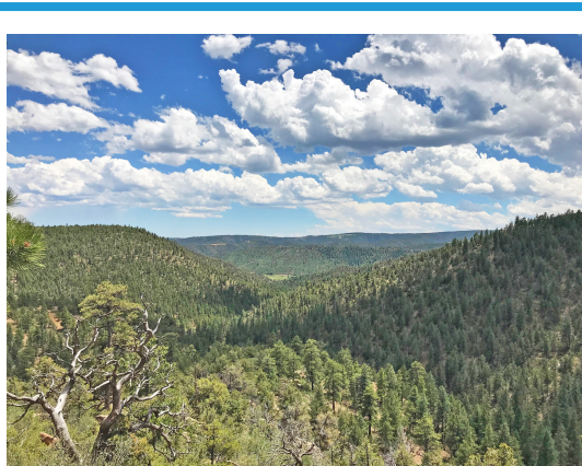
A fully connected natural gas field. The cnReach wireless network works in dense foliage.