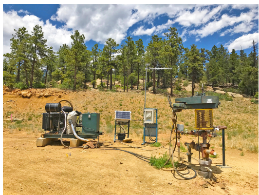
Interconnected devices monitor the status of the site, and cnReach EP radios transmit data.