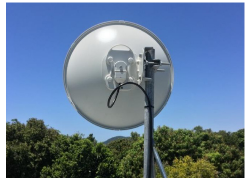
Above is an installer’s point of view. With cnHeat, installers can install the antenna, confirm the connection and move on.

REDFOX CONVERTED ALL THEIR SITES TO CNHEAT , and they use it to pre-qualify all customer service requests. On average, they save $300 for each request whether it is a successful or unsuccessful customer install. Additionally, Redfox identified potential customers from previous install failure attempts and determined which could be offered service through cnHeat. In following up with these opportunities, Redfox has added 15 new customers in a two-month period.