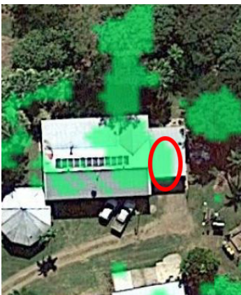
The red circle indicates a suggested installation point in this area with heavy vegetation.