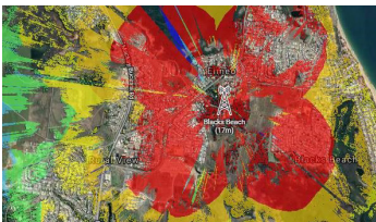
The colors indicate different signal strength levels.