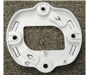
AP Mounting Plate (back) This side faces the ceiling or wall bracket