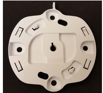
AP Mounting Plate (front) This side faces the AP