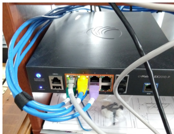
cnMatrix EX2010-P simplifies network operation with zero-touch switch deployment.

MAX THALHAMMER, STUDENT, BETH TIKVAH CONGREGATION