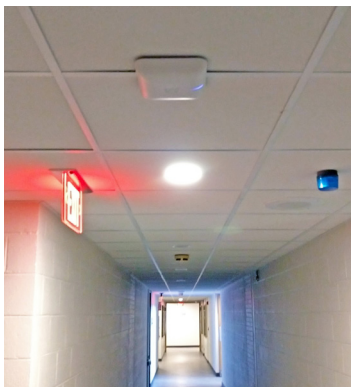
The four cnPilot e410 enterprise APs dramatically sped up the performance of the network.