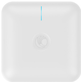
The cnPilot e410 enterprise AP uses 2x2 MU-MIMO and packs a maximum transmit power of 25 dBm.