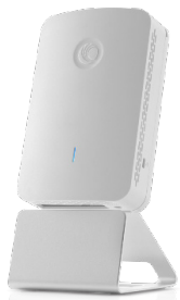
The cnPilot e430 enterprise Indoor Wall Plate AP supports 802.11ac Wave 2 standards based beamforming.

NEIL TUNNICLIFFE, DEPUTY HEADTEACHER, ST. JOHN'S PRIMARY SCHOOL