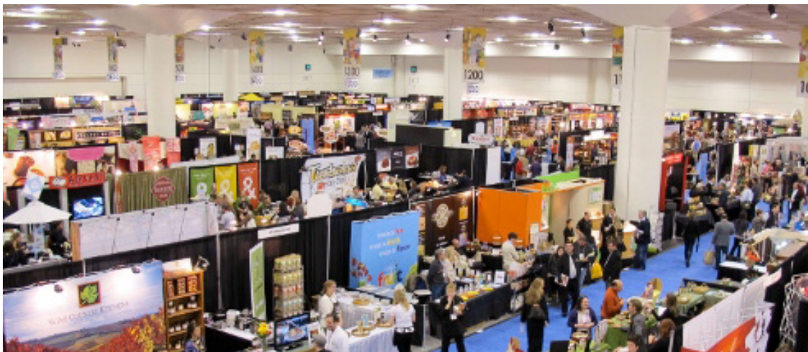
The Xirrus APs have supported up to 18,000 guests at its peak. Additionally, convention organizers and the internal staff at the Moscone Center are supported.

Most events are supported with all 5 GHz Wi-Fi coverage to provide the highest bandwidth connections to users. The unique software-defined radios of the Xirrus solution allow the entire Wi-Fi network to be configured to run at 5 GHz for optimal performance. The Moscone technical team can add 2.4 GHz Wi-Fi coverage for convention customers that put in special requests. The aggregate throughput to the Internet scales to 1.5 Gbps or more for larger events.