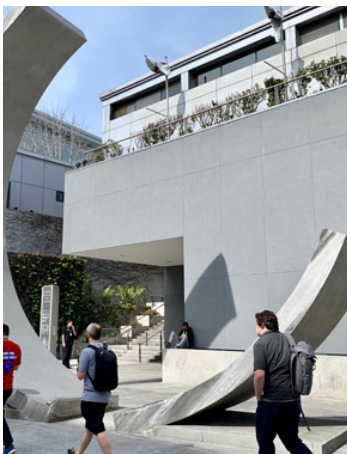
The flagship convention and exhibition center in the San Francisco area, the Moscone Center campus spans 87 acres.

“ DOES MOSCONE HAVE WI-FI? ” is by far the most common question that is asked on the Moscone Center website’s FAQ. For anyone who has been to a convention, tradeshow or exhibition, this may be one of the first questions asked by many convention attendees as soon as they step into the convention center.