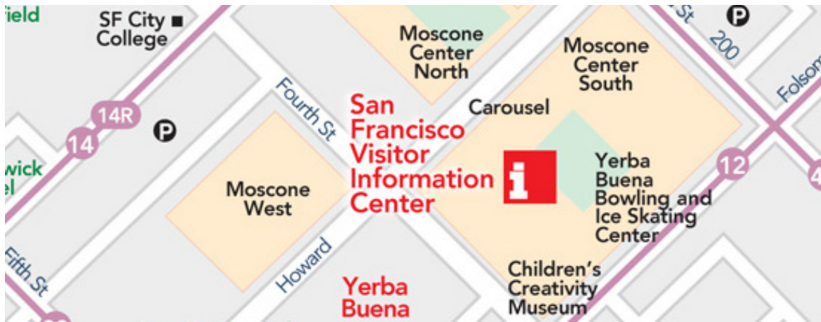
The Moscone Center is divided into three buildings: Moscone North, Moscone South and Moscone West. The three-block, 2 million+ square-foot tradeshow and exhibition center increased the initial 90 Xirrus APs to 375 Xirrus multi-radio APs to cover expansion.

The deployment uses both indoor and outdoor, unique multi-radio Xirrus access points (AP) with software-defined radios to ensure that the Moscone Center has the capacity advantage in their network. Additionally, there are 150 portable APs that can be rapidly deployed on tripods as needed to augment large keynote sessions. To deploy and manage devices in their network, the Moscone Center uses the XMS network management system.