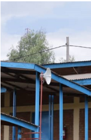
CS Burundi 02202020