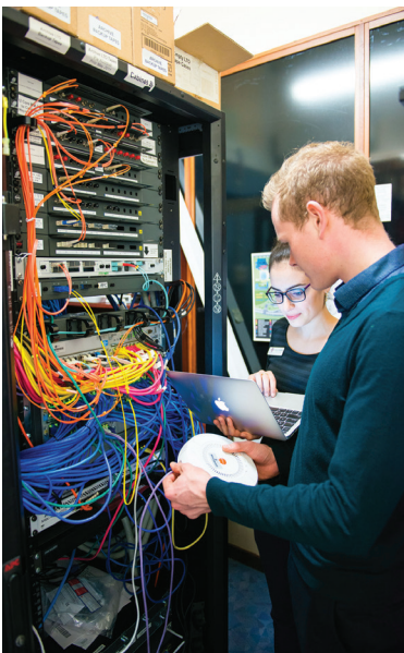
CS F1 Race 03172020