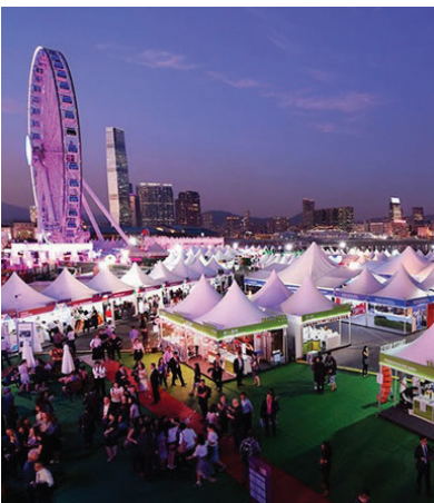
CS Kite Systems 04172020