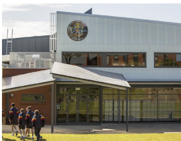
CS St. Bede's 04242020