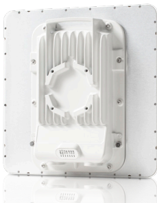
PTP 550 is a Point-to-Point Gigabit throughput solution that operates in the 5 GHz wireless space, addressing the need for high-speed backhaul solutions.