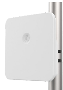
The cnRanger "Tyndall" SM supports 2.5 GHz bands 38, 40 and 41.

Management and provisioning of all three platforms is a breeze with the award-winning cnMaestro™ network manager and the cnArcher™ smartphone installer app. Advanced wireless planning and RF propagation tools such as LinkPlanner™ and cnHeat™ enable network operators to design extensive, accurate wireless networks.