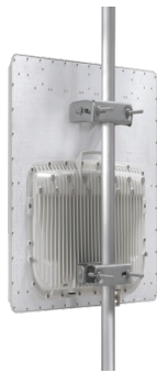
PMP 450m, enhanced with cnMedusa technology, provides MU-MIMO capabilities in 5 GHz & 3 GHz and is certified for use in the CBRS (U.S.) spectrum.

The PMP 450 platform is the highest-capacity platform, supports the highest density of subscribers per sector and is a top choice for many of the world's largest fixed wireless operators. Its software-defined nature enables platform advancement to happen continuously, bringing new features, enhancements and updated performance with every software release. PMP 450 features cnMedusa™ technology which provides massive Multi-User MIMO (MU-MIMO) coupled with uplink/downlink beamforming capability. cnMedusa is available on the PMP 450m access points (AP) for the 5 GHz and 3 GHz bands, and it is certified for use in the new CBRS (U.S.) spectrum. PMP 450 is also available in the 900 MHz and 2.4 GHz unlicensed bands as well as the 4.9 GHz band.