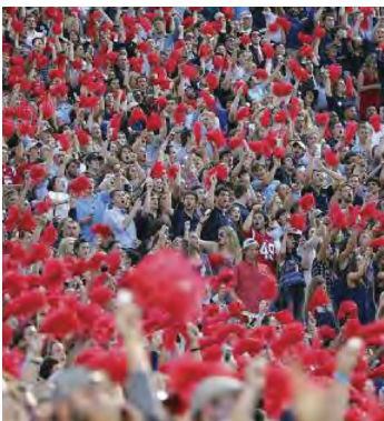
Ole Miss fans celebrate at Vaught-Hemingway Stadium.