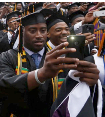
CS Morehouse College 05012020