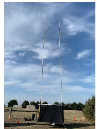
cnReach radios linked two main sites which passed the most traffic. All sites covered an area of 171 kilometers.

WITH TWO cnReach N500 ISM RADIOS , Renta 2-Way linked two main sites which pass most of their traffic to meet increased requirements. The N500s were used to link next generation digital narrowband (NXDN) trunked repeater sites. Initial setup of the links was simple, and they seamlessly integrated into their managed IP network. Renta 2-Way expanded each radio site and added a fully featured IP console which operated at full capacity.