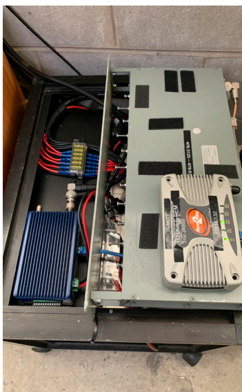
Each cnReach N500 radio linked NXDN trunked repeater sites. Renta 2-Way added a fully featured IP console which operated at full capacity.