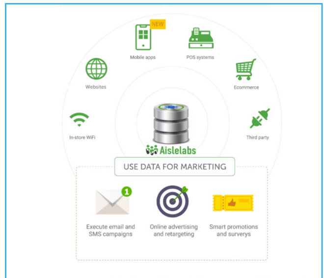
Aislelabs Customer Hub unifies all online and offline customer behavior.