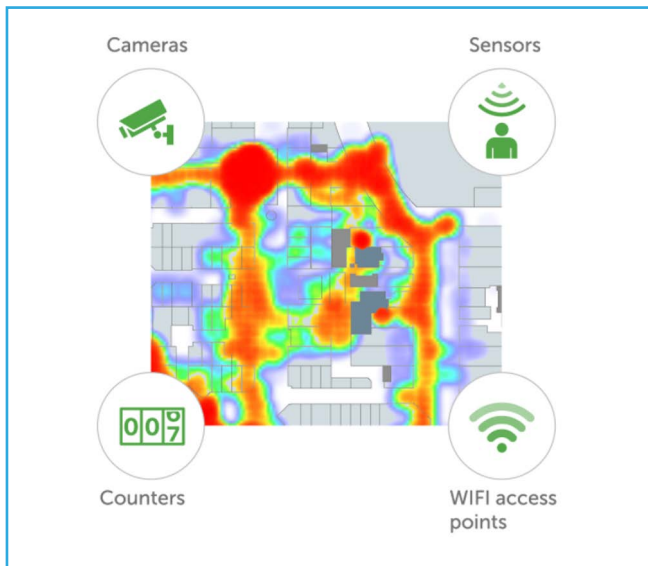
Aislelabs Insights unifies all people counting solutions into a single dashboard.