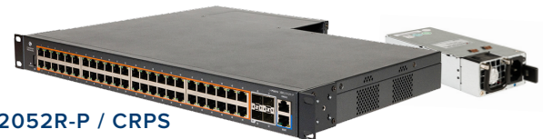
EX2052R-P / CRPS